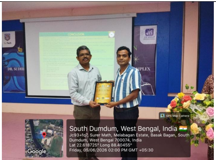
South DumDum, West Bengal, India Jc93+fq7, Surer Math, Melabagan Estate, Basak Bagan, South DumDum, West Bengal 700074, India Lat 22.618725° Long 88.40455° Friday, 05/06/2026 02:00 PM GMT +05:30

Some photos of seminar on 5.6.26 organized by BSH dept.