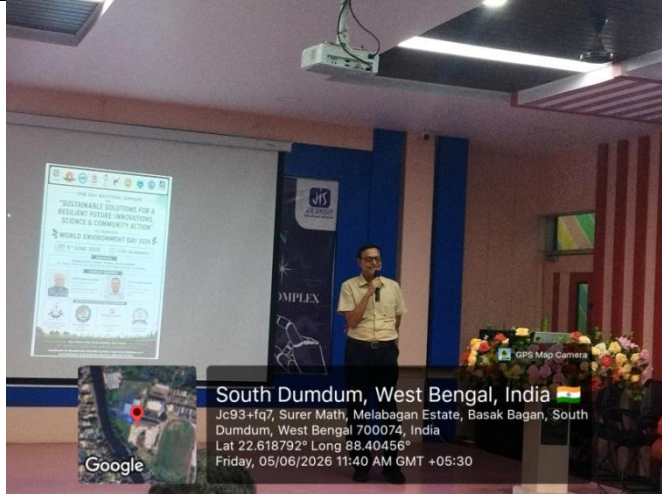
South DumDum, West Bengal, India Jc93+fq7, Surer Math, Melabagan Estate, Basak Bagan, South DumDum, West Bengal 700074, India Lat 22.618792° Long 88.40456° Friday, 05/06/2026 11:40 AM GMT +05:30