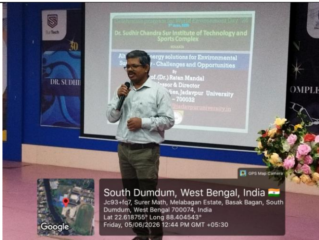
South DumDum, West Bengal, India Jc93+fq7, Surer Math, Melabagan Estate, Basak Bagan, South DumDum, West Bengal 700074, India Lat 22.618755° Long 88.404543° Friday, 05/06/2026 12:44 PM GMT +05:30