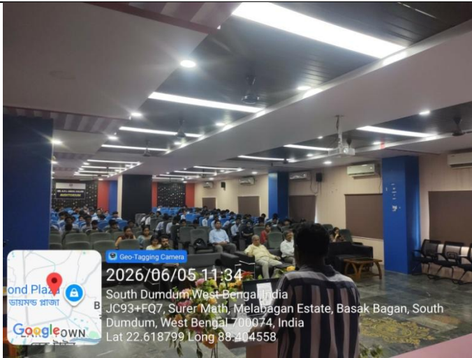
2026/06/05 11:34 South DumDum, West Bengal, India JC93+fq7, Surer Math, Melabagan Estate, Basak Bagan, South DumDum, West Bengal 700074, India Lat 22.618799° Long 88.404558