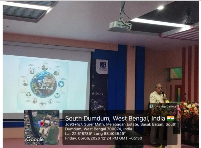
South DumDum, West Bengal, India Jc93+fq7, Surer Math, Melabagan Estate, Basak Bagan, South DumDum, West Bengal 700074, India Lat 22.618785° Long 88.404549° Friday, 05/06/2026 12:24 PM GMT +05:30